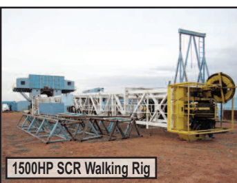
1500HP SCR Walking Rig

9:00 AM (MDT) Each Day @ The Ramkota Hotel & Conf. Center