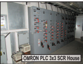
OMRON PLC 3x3 SCR House

DITCH WITCH OR-52 Dirt Compactor • ALKOTA Heated Press Washer w/125-Gal Tank • DEWALT & CRAFTSMAN Press Washers • (5) Trash Pumps • Pipe, Chain & Hammer Wrenches • Shop Air Compressor