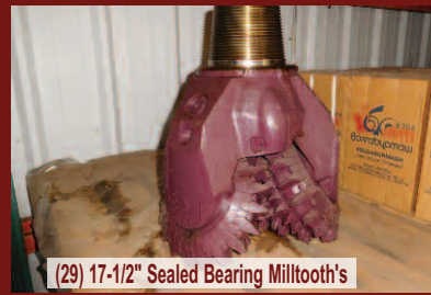
(29) 17-1/2" Sealed Bearing Milltooth's