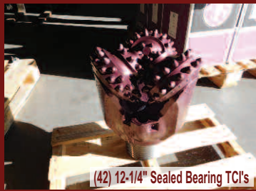
(42) 12-1/4" Sealed Bearing TCI's