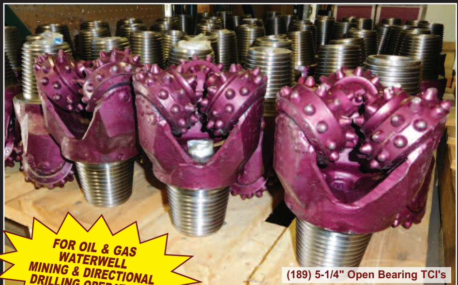
(189) 5-1/4" Open Bearing TCI's

Selling 2,000+ 2-15/16" to 17-1/2" NEW TCI & Milltooth Drill Bits!