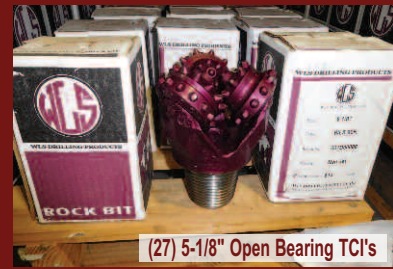
(27) 5-1/8" Open Bearing TCI's