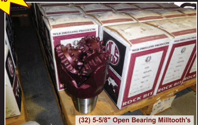
(32) 5-5/8" Open Bearing Milltooth's

FOR MORE INFO - Call 432-563-2005 or View Online at www.kruseenergy.com