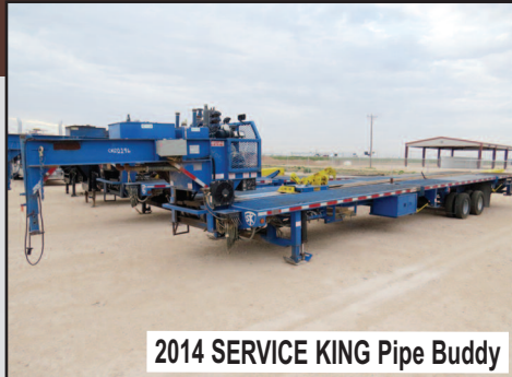
2014 SERVICE KING Pipe Buddy

(9) SHAFFER 7-1/16" 5M Hyd Dbl BOP • (9) TOWNSEND 81 7-1/16" 2-3M Hyd BOP • HYDRIL DR 7-1/16" 2-3M Hyd BOP • (2) WSI 7-1/16" 2-3M Hyd BOP • TOWNSEND 7-1/16" 2-3m Hyd Dbl