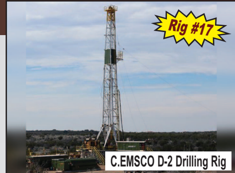
C.EMSCO D-2 Drilling Rig

(3) 2012 SOUTHERN FRAC 500-Bbl Flowback Tank • 2011 DRAGON 500-Bbl Closed Flowback Tank • 2010 DRAGON 500-Bbl Closed Flowback Tank • (4) 2007 WICHITA 500-Bbl Closed Flowback Tank • 2008 DRAGON 500-Bbl Closed Flowback Tank • (NOTE: All Flowback Tanks Equipped w/Dual Gas Busters & Static Drain Lines) 32'L 215-Bbl Sgl-Comp Tank w/Gas Buster