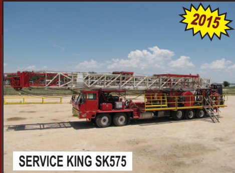
SERVICE KING SK575

DRILLING RIGS • WELL SERVICE RIGS • TRUCKS/TRAILERS • DRILL PIPE & COLLARS WELL SERVICE PUMPS & SWIVELS • AIR COMPRESSORS • FISHING & RENTAL TOOLS