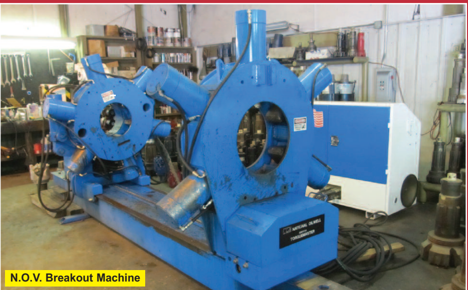
N.O.V. Breakout Machine

Call OKC Office @405-745-3733 or visit www.kruseenergy.com